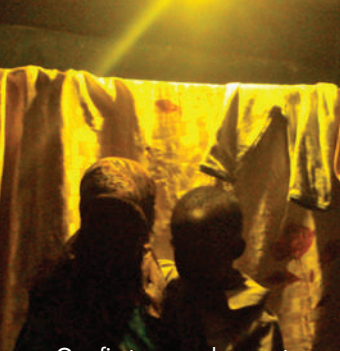
Our first research report, "The Moved and Shaken: How Forced Relocation Affects the Lives of Urban Refugee Women and Girls," provides a look into the life of refugee women in Nairobi and their thoughts on relocation to the camps.