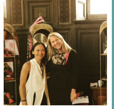
We were honored to attend Women Moving Millions 2014 Annual Summit in NYC to feature our Maisha Collective scarf line.