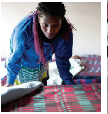
Our Safe House was registered with the Government of Kenya as a Charitable Children's Institution, the first serving refugees to receive this designation under Kenya's Children's Act.

The Global Fund for Children honored us with a Global Catalyst award in recognition of our work with under-served children and for aspiring to new levels of financial and programmatic development.