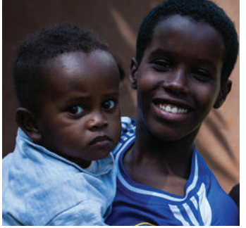
In our new formal partnership with UNHCR we will serve as the agency's partner for child protection in Nairobi, enhancing our ability to identify vulnerable children and advocate and protect their rights.

We continue to work with UNHCR's Advocacy Working Group to combat xenophobia and advocate for a fair and just Refugee Bill, which we expect to be passed in 2015.